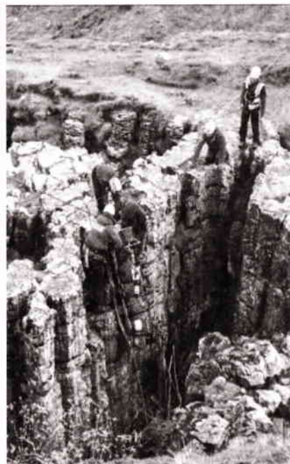
Rescue training in 'the Butter Tubs'